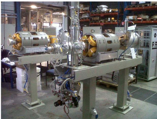
Figure 5: The external beam - assembled in Belgium - consists of two parts, one for each bunker. The quadrupole doublets and the neutron shutter are visible.

One of the eight extraction ports of the cyclotron is permanently connected to the Beam Transport Line (BTL), equipped with two focusing quadrupole doublets (Fig. 5). A neutron shutter together with local shielding will allow access to the beam line vault also during the irradiation of standard targets in the cyclotron vault, minimizing interference between production and research activities. The beam line is designed to transport high current beams and to obtain a variable beam spot on target down to 5 mm diameter. This set-up is ideal for solid target irradiation, new target developments and multi-disciplinary research activities.