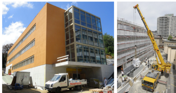
Figure 1: The “SWAN Haus” at the Inselspital in Bern (left) where cyclotron and its external beam line have been “rigged” in June 2011 (right).

A dedicated building (Fig. 1) has been planned to host radioisotope production, research activities and patient care, paying special attention at the integration of this new structure into the existing hospital environment.