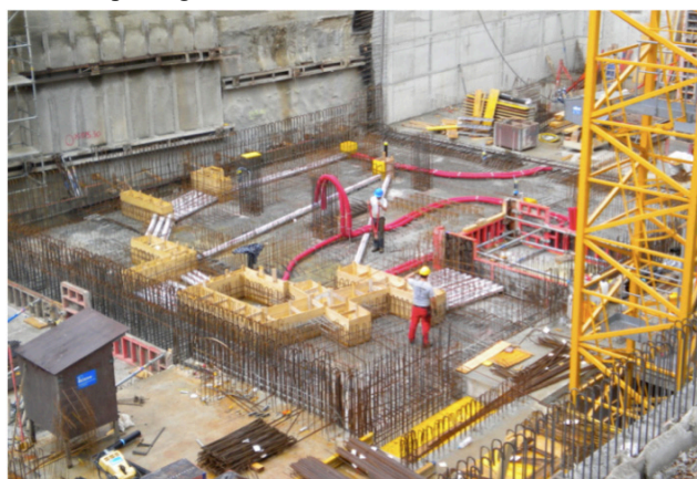
Figure 3: The construction of the cyclotron laboratory in June 2010: the trench lines for the cyclotron and the external beam line are visible together with the structure of the bunkers, the underground pipes for the laboratories and for the automatic transport of solid targets.

To perform production and research activities in parallel and with minimal interference, two bunkers have been designed, the former hosting the cyclotron and the latter a 6 m long beam line dedicated to research. On the same floor, the control room, the technical areas, a physics laboratory and a workshop are connected to the bunkers by means of specific underground pipes, as shown in Fig. 3. The laboratory has been designed to be as flexible as possible for offering a multi-disciplinary platform for research activities. Special pipes have been installed for the extraction of solid targets without the need of opening the bunker doors.